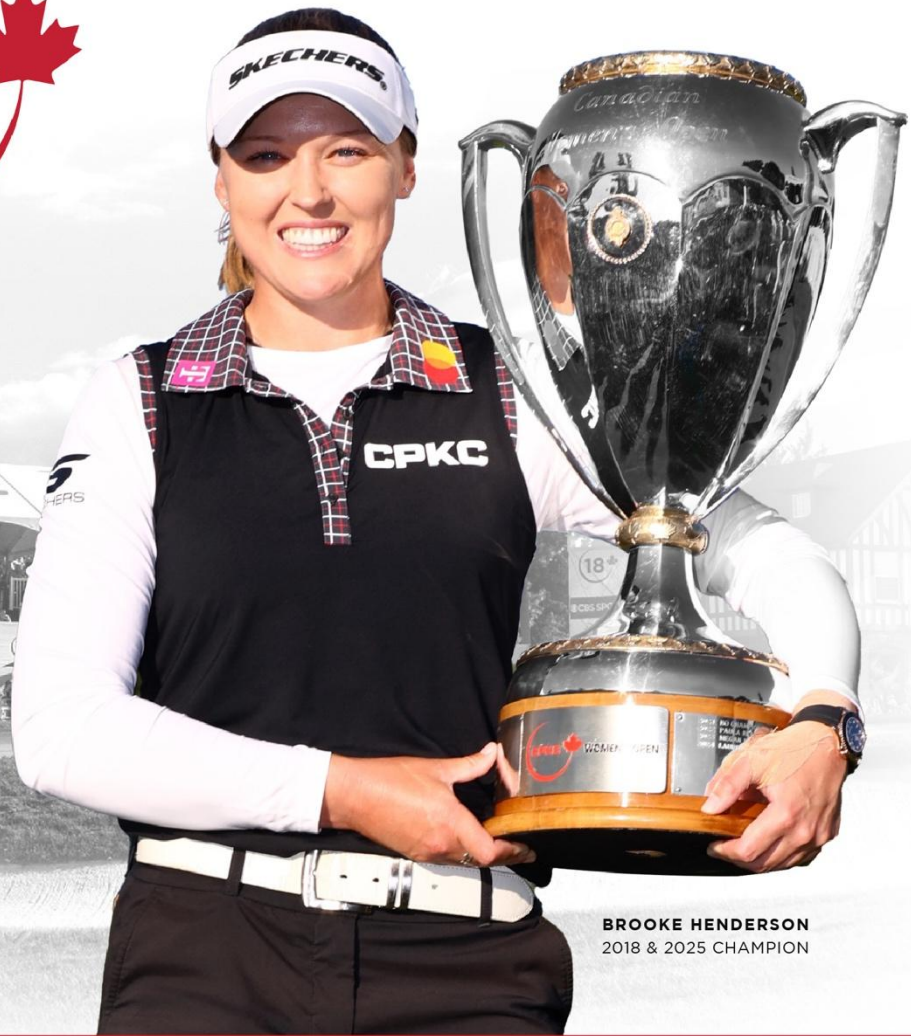
BROOKE HENDERSON 2018 & 2025 CHAMPION